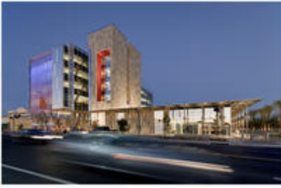
View of council chamber and courtyard at night