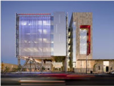
View of office tower from west

Chandler City Hall is a low- to mid-rise government complex developed on two city blocks and located with Arizona Avenue along its eastern edge and Washington Street as its western edge in downtown Chandler. The center of the development is bisected by Chicago Street. The north block is devoted to a 5-story office tower at the north end and one-story buildings along Arizona Ave and Washington Street. The tower houses City departments while the 1-story buildings contain an art gallery, council chambers and a television studio. The south block is devoted to one-story buildings and a 2-level parking structure. The buildings contain a neighborhood redevelopment office and a print center.