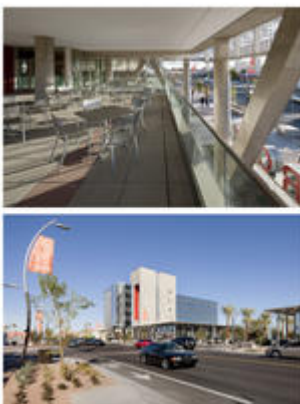
Views of open mezzanine and street frontage