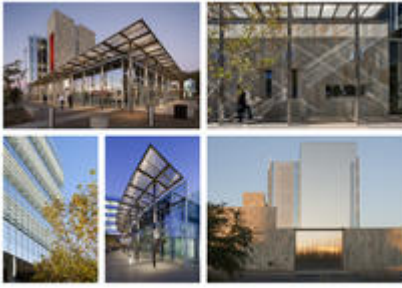
Collage of material images

The overall design and material selection embody both a reflection of the progressive nature of this knowledge community and a timelessness that respects the past. The single-story buildings are a modern interpretation of the regional historic vernacular that emphasized mass, punched window openings and shaded walkways. Stone was used to emphasize mass and be representative of a civic center aesthetic. Metal and glass were predominately used throughout the complex to express to the community, "We are about the future, and one of openness and transparency."