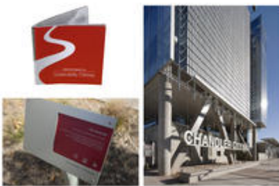
Images of “Sustainability Pathway” and “Turbulent Shade” façade system

A very accessible dialog of sustainability has been interwoven into the project through two key elements. A poet and graphic artist created the “Sustainable Pathway,” which provides visitors a self-guided tour of the building's sustainable elements marked by descriptive signs and noting whether the strategy is socially, economically or environmentally focused. A public artist created “Turbulent Shade,” an shading element that is very much connected to the physical environment by moving with the wind. Sustainability is on display for the community to interact with.