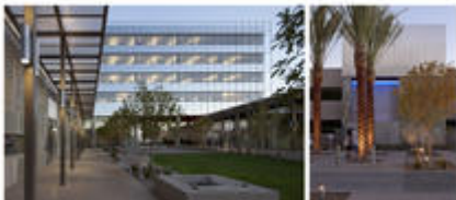
Views of courtyard and cooling tower water feature

As with any facility located in a desert region, water conservation is critical. The Chandler City Hall complex has taken a comprehensive approach to reducing potable water use. Both interior and exterior strategies were employed. The interior approach utilizes low-flow water-conserving fixtures, while the exterior approach utilizes high-efficiency drip irrigation and low-water-use native plants. The project also focused on the process side by capturing “blow-down” water from the operation of the cooling towers and the condensate water from the HVAC systems. Large volumes of water normally get dumped down the sewer when employing cooling towers. This water is non-chemically treated and reclaimed for the purpose of supplementing irrigation and waste conveyance. During the summer months, there is an excess of water generated, so no potable water is being used for interior or exterior systems. Less water is generated during the winter months, which requires some potable water.