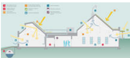
Light and air flow diagram - Photo Credit: Opsis Architecture

To achieve the optimum level of daylight in the science and music classrooms and energy efficiency, the project team performed multiple detailed daylighting studies. The resulting design combines translucent skylights, clerestory windows and traditional windows with deciduous vines for seasonal shading, allowing views in multiple directions from most building locations. Light-colored acoustic panels help reflect natural light from the clerestory windows deep into the classroom space. Fresh air is provided by a system combining operable low and high clerestory windows and rooftop ventilators to allow cross and stack ventilation.