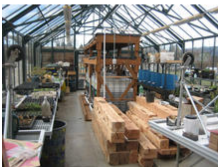
Blue barrels store collected rainwater for irrigation - Photo