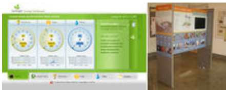
Earthright Energy Dashboard (left) displays current building energy use online and on-site on an informational kiosk (right)

Energy, daylight, electric lighting and solar access were all modeled during the design of the building. Different configurations of skylights and clerestory windows were examined in both the daylight and the energy models, and these models were essential in finding a balance between benefits for both these systems.