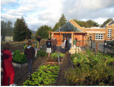
Students learning in outdoor garden classroom - Photo Credit: Opsis Architecture

Design of the site combines low-water, native vegetation, which populates 18,100 sf—nearly all of the landscaped area surrounding the project. The building footprint was minimized to allow 21,560 sf of vegetated open space to be preserved.