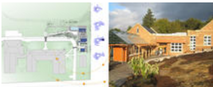
Climate analysis (left) influenced the building orientation which shelters the entry (right) from prevailing winds

The project is located in a scenic area near the Columbia River Gorge, a site that receives moderate annual rainfall, good solar exposure and significant seasonal temperature swings. It is fairly rural in character, surrounded by farms, orchards, and Hood River's downtown Main Street to the northeast.