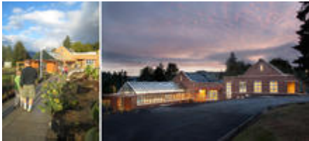
Student garden (left), front entrance to new music and science building (right) -