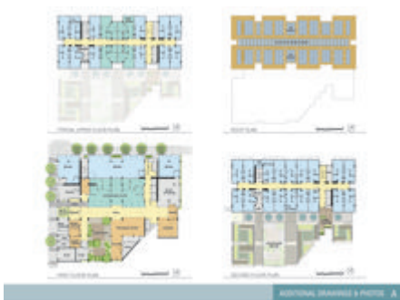
Additional Images - First Image - Photo Credit: LMS Architects